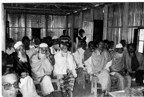
Photo 1. Village committee meeting

A village in Bangladesh usually consists of several small communities called ‘ para ’. D village has 4 communities and each of these has several matabbors . To set up a village committee, a general meeting was held in the classroom of the primary school in the village on January